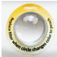
Filter is good